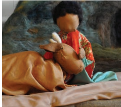
Puppets from "Akimba and the Magic Cow" at last year's Cobb Meadow School puppet show and silent auction.