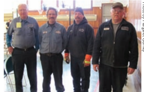
The town's road crew set up chairs in the DCS gymnasium before the event. Thanks to all!