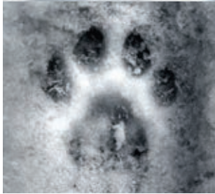
The magnificent bobcat, above, and its paw print in snow.

They have large eyes, which help them to hunt small mammals such as rabbits, squirrels and mice but they can also bring down a deer trapped in deep snow. In our area, they will also capture turkeys and pheasants.