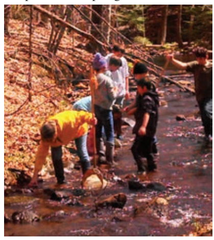
Fourth and fifth graders identify and count aquatic invertebrates in Mills Brook.

There's more! Before school ends (June 20) our students will experience the first annual six-school Field Day, organized by two of ConVal's PE teachers, and taking place at ConVal High School. This will be an extravaganza, and we are all looking forward to