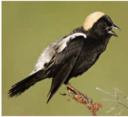
Audubon Field Guide

Ecologists refer to hayfields and pastures as "surrogate" grasslands, but the farmers who own the land have another term,