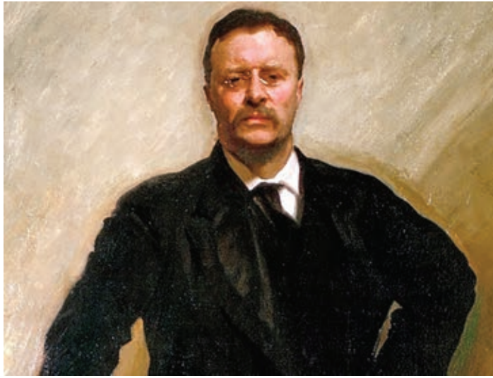
Theodore Roosevelt painted by John Singer Sargent, 1903.

war between Russia and Japan with the Portsmouth Peace Treaty in 1905.