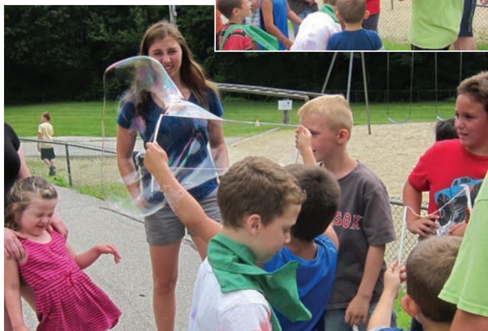
Staff and campers alike watch with glee the preparation and blowing of giant bubbles.

There’s one group building dams and diverting miniature rivers after