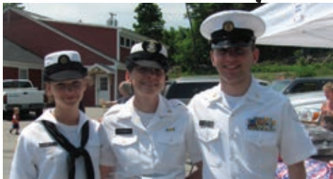
Three Letourneaus last year.