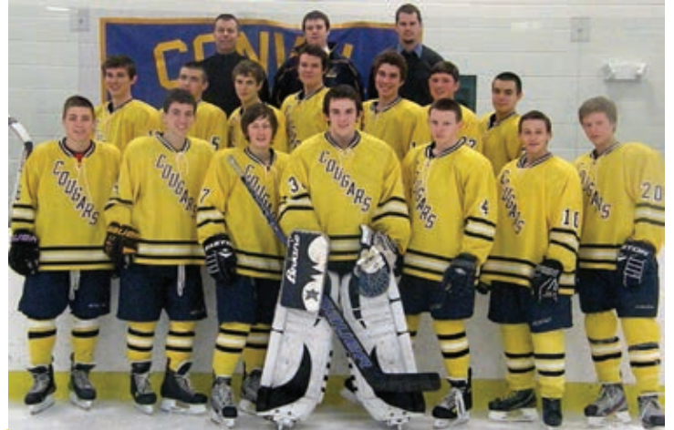
The ConVal Boys' Ice Hockey Team 2012-2013 would like extend our thanks to the community and businesses of the town of Dublin. We greatly appreciate your support this past season.