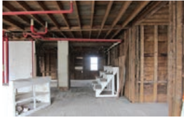
Front to back of the first floor of the future Community Center is shown here, ready for new construction. All pipes will be removed, and in front will be a large multi-purpose room. The back will house a kitchen, office, two bathrooms, and a study/computer room.

BRUCE SIMPSON serves on the board of the Dublin Community Center.