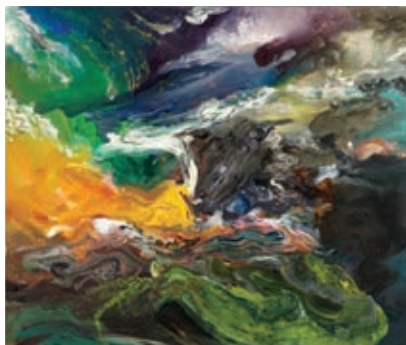
Jules Olitski, Bear Island Spirit , 1998, acrylic on canvas, 40 x 48 in.; courtesy Olitski Family Estate.

The work of 30 international artists incorporating tools and hardware. Sept. 19 – Oct. 21