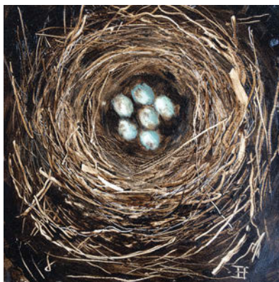
Painting by Joan Barrows

More than 200 entries include water-colors, oils, pastels, photography, as well as blown glass, pottery, origami, jewelry, and more. The pieces range in size from 3x3 to 5x7, and include 3-dimensional pieces. They are affordable,