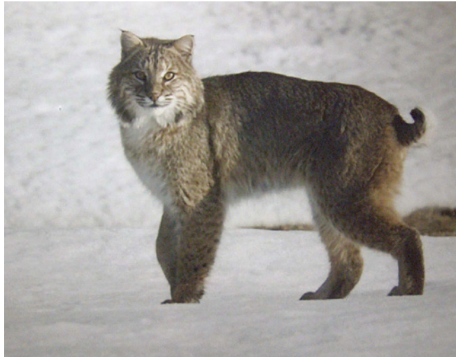
hangs in front hall of The Harris Center for Conservation Education in Hancock.

Bobcat dens are located in caves, hollow logs, rocky ledges, or overturned stumps. Their favorite food is snowshoe hare or cottontail rabbits, but they also eat mice, squirrels, foxes, house cats, fisher cats, ruffed grouse, and other birds. Bobcats cache their food under snow and hemlock branches.