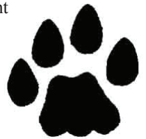
Paw print of a bobcat