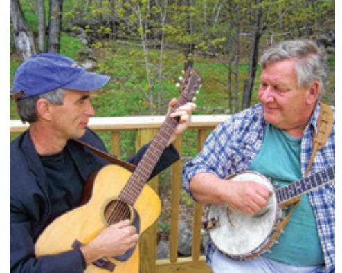
The Grumbling Rustics