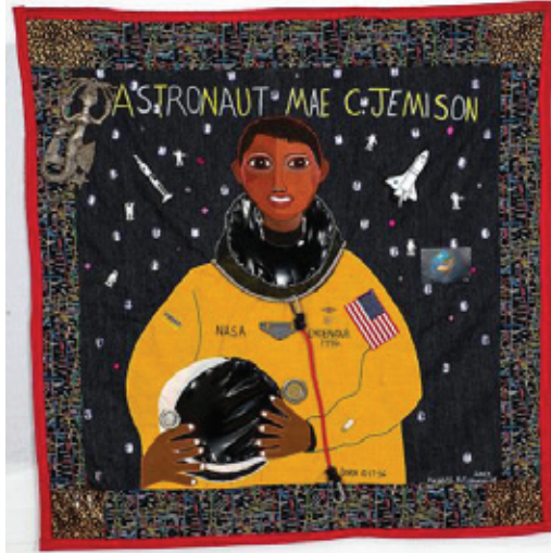
This 1992 photo of a quilt showing Dr. Mae Jemison, Astronaut, from "And Still We Rise" for the Women of Color Quilters Network.

Please visit the links below and share with your network. The first link is a very short video about the exhibit; the second takes you to the homepage of the exhibit; and the third is an audio clip from a recent NHPR piece on the exhibit.