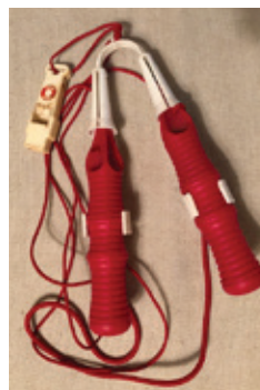
A set of ice picks.

thicker. Rivers and lakes are more prone to wind, currents, and wave action that weaken ice.