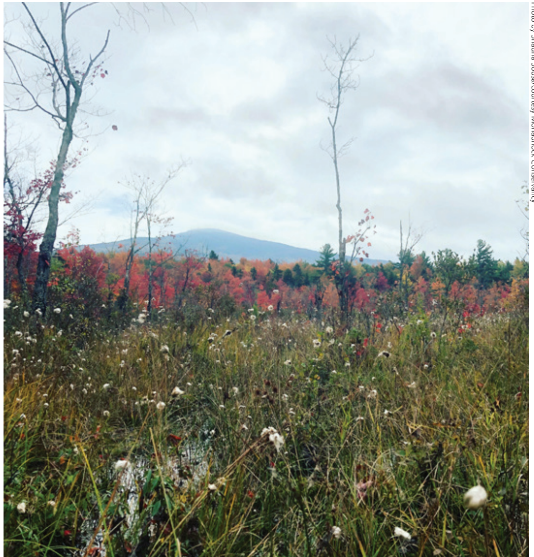
Wetlands on the conserved Birch property in Dublin are great habitat for moose, turtles, and mink.

Many in town as well as other locals and visitors will also benefit from the emphasis on the natural world, rather than man-made development, with pleasing views of trees and ferns lining unpaved Old Troy and Old Marlborough roads. Sweeping views of woodlands dotted with open meadows and wetlands can be had from the nearby summit of Mount Monadnock.