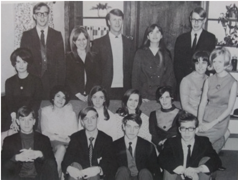
The DCA Class of 1969 will celebrate its 50th class reunion.