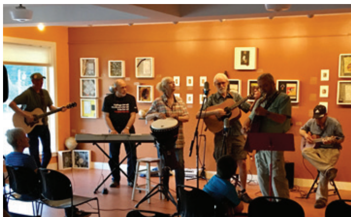
Members of DubHub Song Circle performing at the DubHub Open Mic in June.

Song Circle will be held on the first Friday of the month for the next season, following the art opening, starting on September 6. This is an informal gathering of guitar players, bassists, mandolinists, singers, fiddlers, and other instrumentalists. The group plays folk, pop, blues, and American