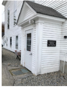
The Church's entry where new shelving for food drop-offs and pick-ups is housed.